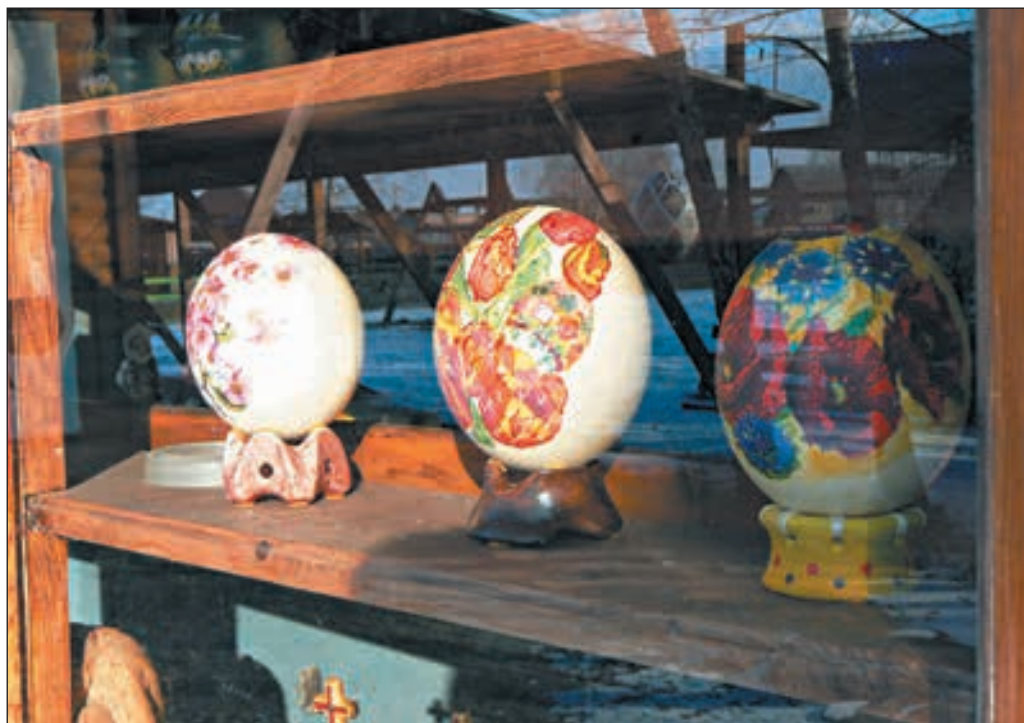
The painted eggs of ostriches are a great souvenir

The shell is not broken but used to make souvenirs — applying decoupage to paint and carve it. A souvenir egg price varies depending on the complexity of work.