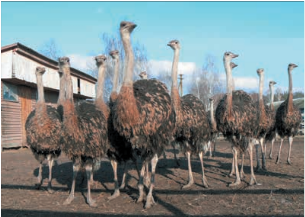
"Dolyna Strausiv" farm

Eight years ago the new masters of an ordinary poultry farm decided to turn it into an entertaining complex with a restaurant, a wine cellar, a tasting room, a playground