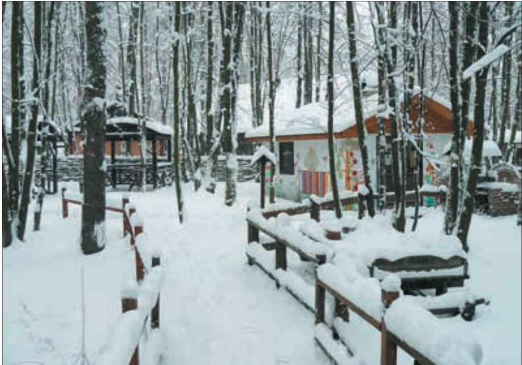
Ethnographic facility "Ukrainian village"

By the way, in the Ukrainian village it is believed that Masnytsia is a Russian tradition: pancakes, troika, and a balalaika, whereas we have Kolodiya festival, finishing the winter cycle. Koloda is a symbol of winter cold, boredom, stagnation and uncertainty. It is tied with a rope to single lads and girls to demand a ransom for not