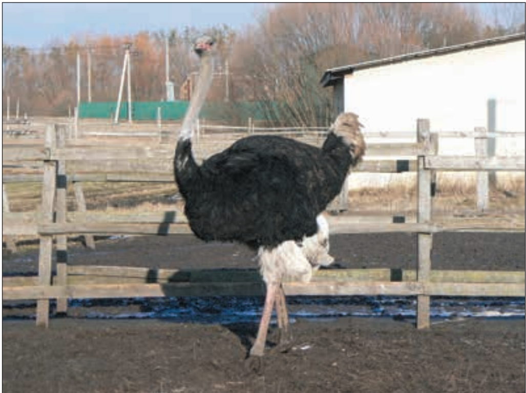
You can ride this ostrich

If the weather is good, there may be over a thousand guests here to celebrate the occasion. The thing is that people miss nature during the long winter period and it is worth going to the country for Masnytsia.