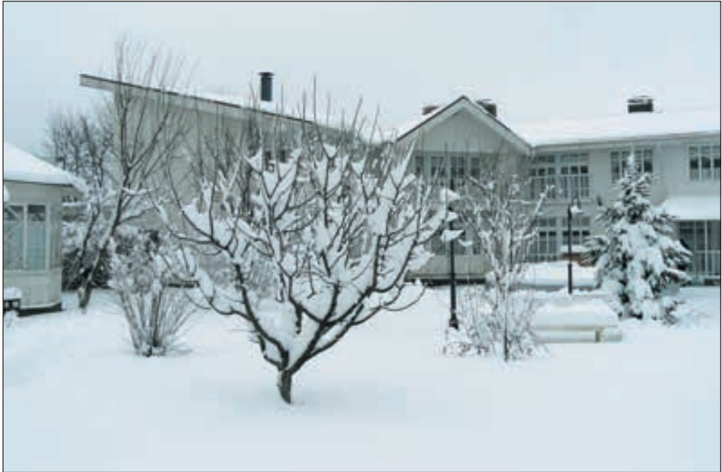
Restaurant "Babusyn sad"