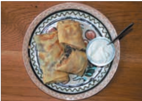
Pancakes with chicken

A folk band singing songs and dancing, as well as a special pancake menu comprising