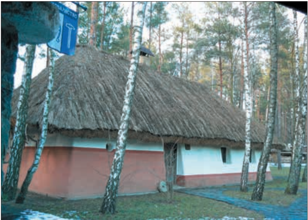
Khata with slanting walls and a thatched roof, depicted on the facility logo.

The ethnic restaurant and hotel houses are just a part of a large ethnographic facility called Ukrainian village that